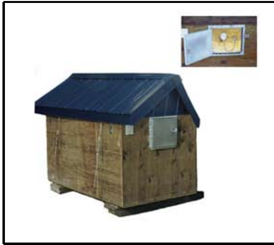
Sewage Tank Installed