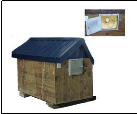
Sewage Tank Installed