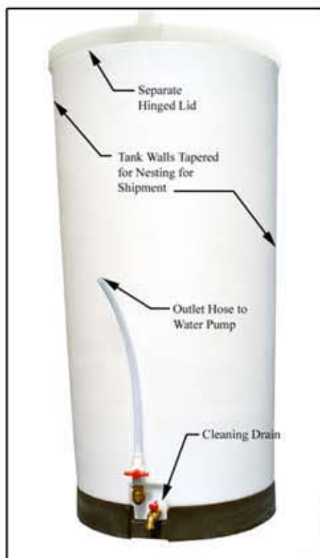
Photo of tank showing base and recessed outlets