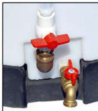
Close-up photo of recessed outlets